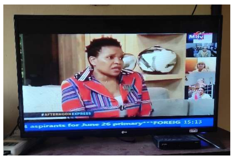
Fig. 15: MITV Multiple screen interactive.