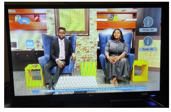
Figure 6: Silverbird Interactive Phone-in Live.