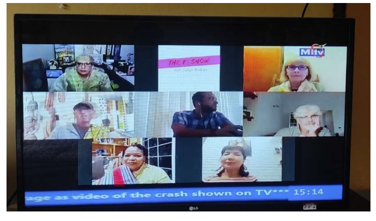
Fig. 16: MITV Multiple screen feature.

Social media and television broadcasting have a number of connections and interrelationships that have led to the phenomenon of Social Television, an emerging communication digital technology that centers around real-time interactivity involving digital media displayed on television and allowing online access to television shows on a range of desktop and mobile computer devices, that are still evolving today in the 2020's.