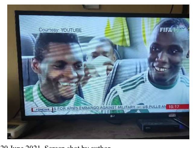
Figure 11: LTV/FIFA TV/YOUTUBE