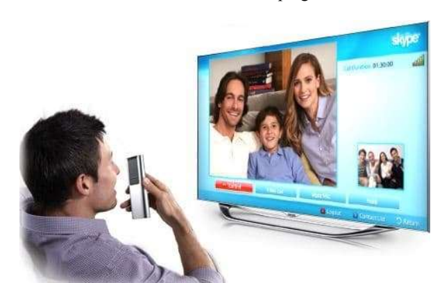
Figure 4: The internet is the main factor in developing the new model of Television.