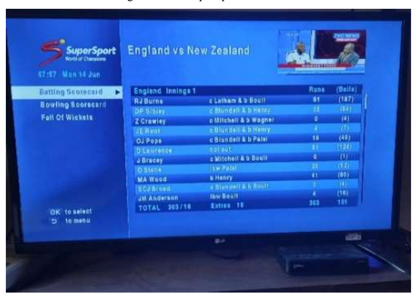
Fig. 13: TVC/SuperSport interactive.