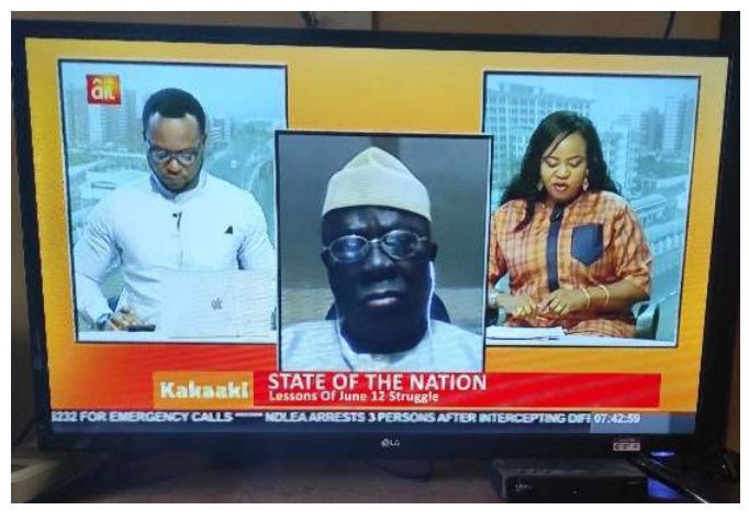
Figure 14: AIT Multiple Screen interactive.