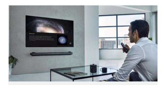
Figure 3: Giving a voice to Television. Support for both built-in and third-party voice.