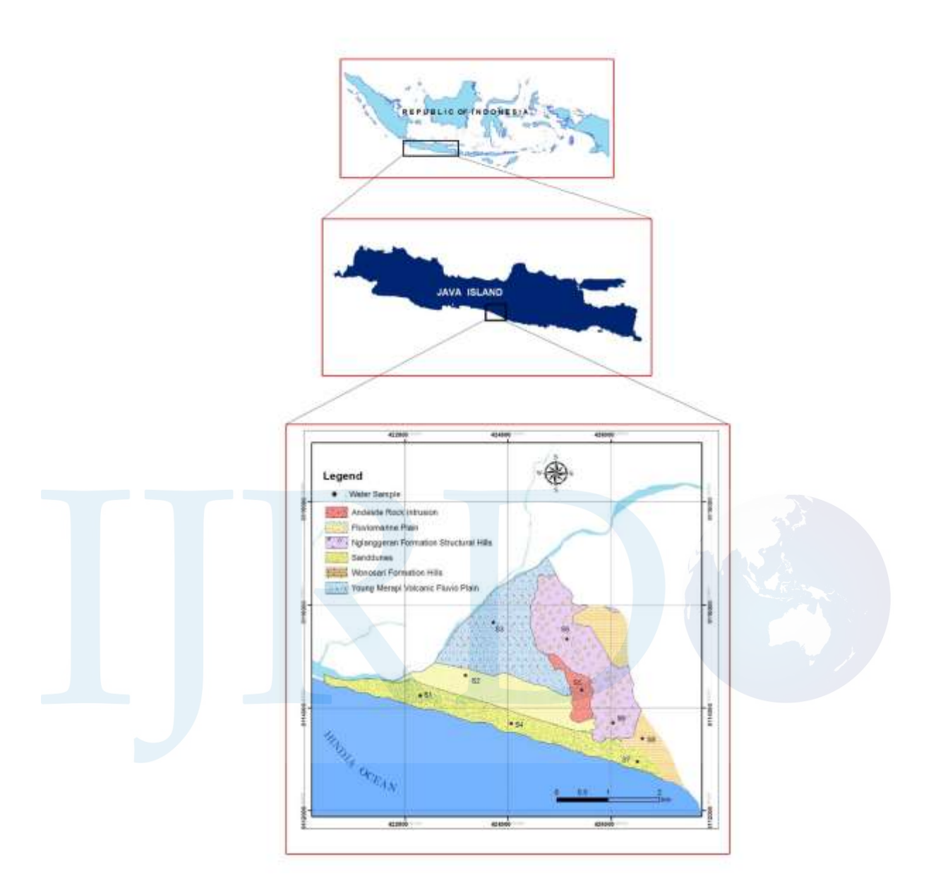
Figure 1. Samples location and study area

The effect of seawater to the groundwater can be determined based on the content of Cl^{-} , HCO_{3}^{-} dan CO_{3}^{-} ; by performing calculation using the formulation as follows [<sup>6</sup>]: